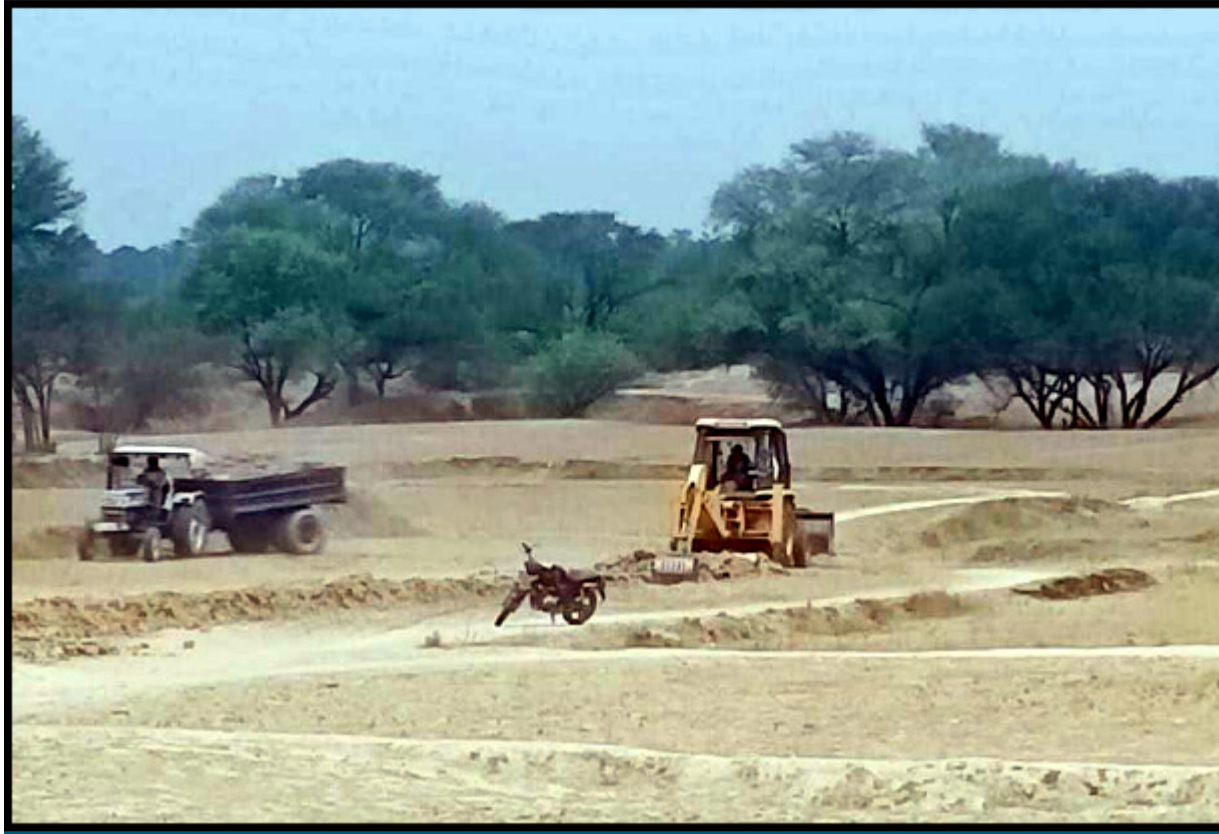
The dominance of mining mafia in Manda area of Yamunapar area has become a cause of trouble for the common people. Even the police seem to be bowing down before the mafia. Mining continues day and night. But the police remains a spectator. Apart from this, the entire village has been polluted by dust. Even after many complaints, the police is not coming out of Kumbhkarni slumber. Similarly, mining is going on in different villages of Manda area. Even in Dighiya Pulos Chowki area, mining mafias excavated the soil of the government pond in broad daylight and sold it at huge prices. But the police remained indifferent.

Logically, dogs maintain body temperature by panting. When they pant, evaporation takes place leading to cooling of their body. Just as humans eat less during summers, the appetite of dogs reduces too. Their feet are most susceptible to heat and burns and one should get shoes for them to wear while walking outside. Normal temperature for a dog is 101.5 degree Fahrenheit. Avoid giving meat because during this season meat is sometimes infected. Just following some simple summer tips can help your animal friends stay healthy and energised so that you can still have fun with them in the sun.