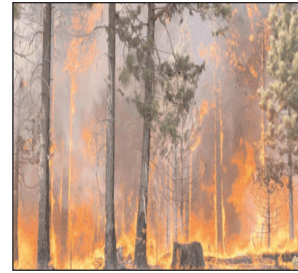
ees on grounds of

Following a review meeting on forest fires and upcoming Char Dham yatra on Wednesday, Uttarakhand CM Pushkar Singh Dhami ordered suspension and disciplinary action against 17 forest department employ-