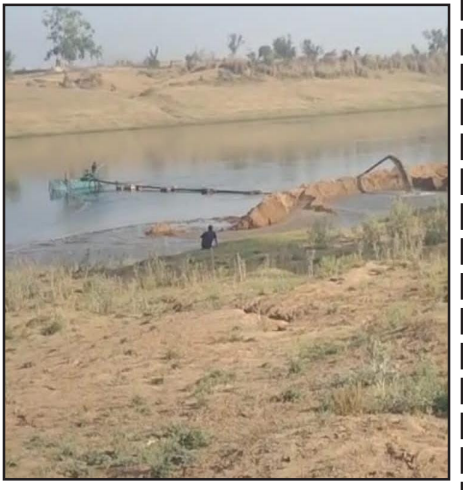
demanded from the District Magistrate to ban sand mining due to mechanization tak- 2023, he was honored by Dilip Kumar ing place in the river bed.

chines is in full swing these days. There are heaps of sand at many places without storage permission. While the mining department is collecting royalty from mining, illegal mining poses a serious threat to the environment. The villagers of the area have