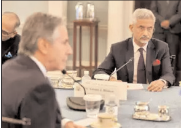
Foreign interference is unacceptable, regardless of the country behind it

NEW DELHI: External affairs minister S Jaishankar emphasized the nation's right to comment on US political views on Indian democracy. He argued for mutual respect among democracies and underscored India's strengthened regional relations while acknowledging challenges due to political changes in neighboring countries. External affairs minister S Jaishankar on Tuesday strongly defended India's right to respond to US political leaders' comments about Indian democracy during an address at the Carnegie Endowment for International Peace in Washington. In a pointed message, he said the US should not "feel bad" if India comments on their internal affairs in response. In a candid response to questions regarding US political figures' remarks on India's democracy, Jaishankar explained that the globalised nature of the world has blurred the lines between domestic and