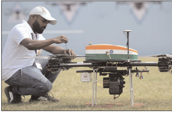
Nurses, patients seek inclusion in task force for med staff safety

An "appropriate methodology", with the requisite technical evaluation parameters, is being formulated to prevent Chinese components and electronics from finding their way into the drones. Various methods are being deliberated upon to strengthen this framework, Army Design Bureau additional director general Major General C S Mann said on Wednesday. This urgent requirement has come to the fore after the defence ministry recently put an order for 200 medium-altitude logistics drones for the Army on hold, asking the manufacturer to