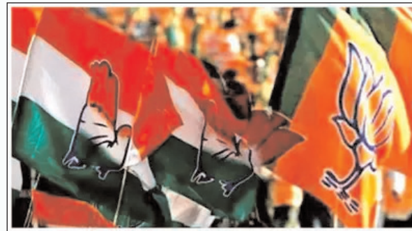
'400 paar' call backfired, was linked to negative narrative: Shinde

NEW DELHI: After formation of Modi-3.0 govt, the focus now shifts to who will be the next BJP chief amid looming electoral battles, including in Maharashtra and Haryana, where the party is incumbent and where it performed badly in Lok Sabha polls. J P Nadda, who has been inducted as a key cabinet minister in Modi govt, has completed his tenure as party chief and the process to elect his successor is likely in the next few days. A decision on nominating a working president pending election of a full-time chief will be taken by the party brass. Though replacements have been smooth affairs, party circles and others will be watching whether it will be influenced by the desire for fresh reachouts to OBCs and women. With many prominent faces, including those