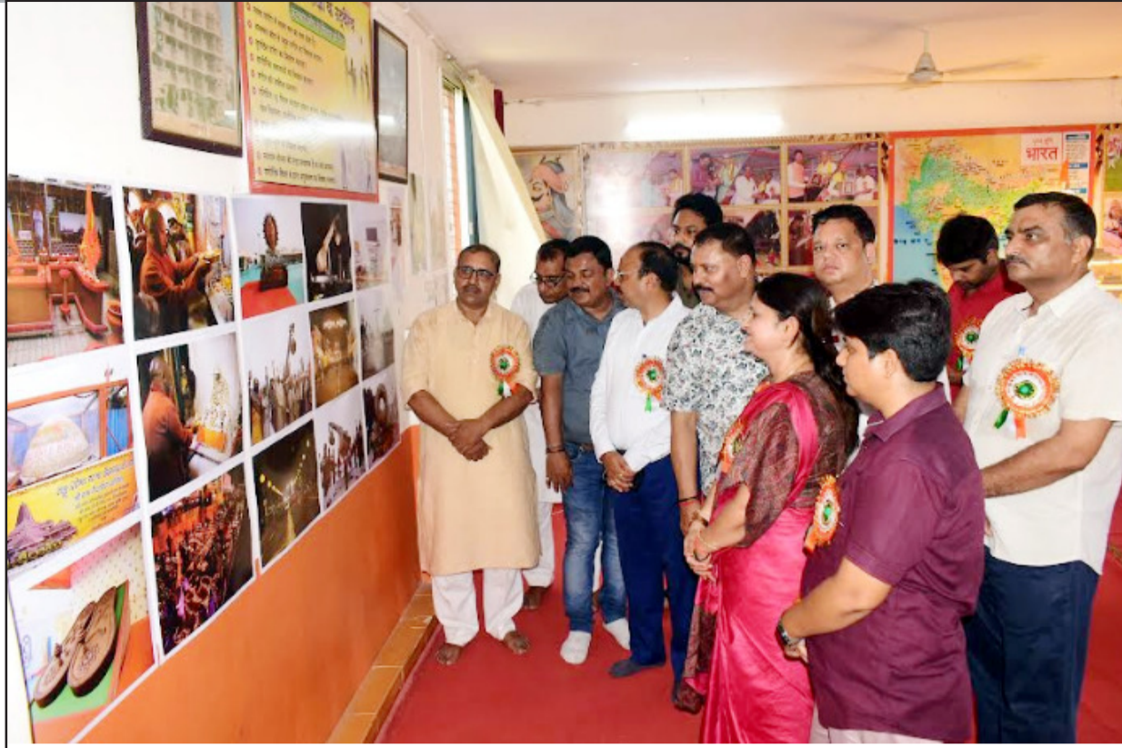
Guests attending the picture exhibition at Jwala Devi Inter College, looking at the picture exhibition.