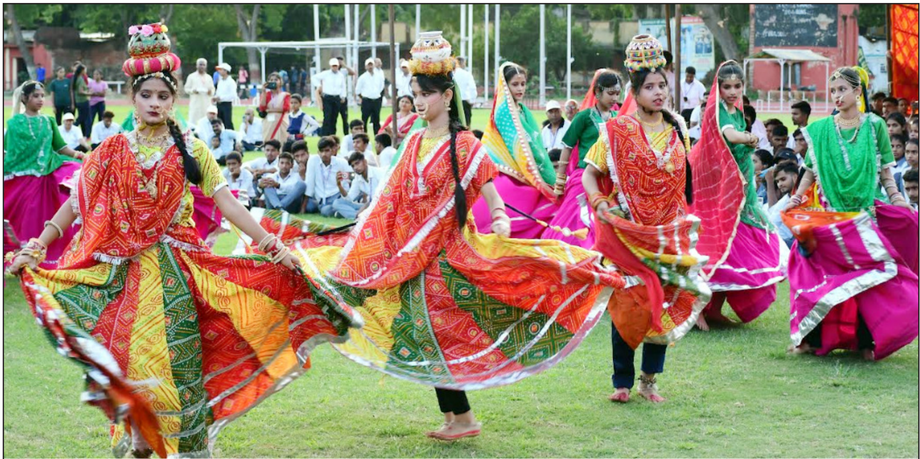
Children participating in the 35th sports competition at Madan Mohan Malviya Stadium and girl students dancing in a cultural program.