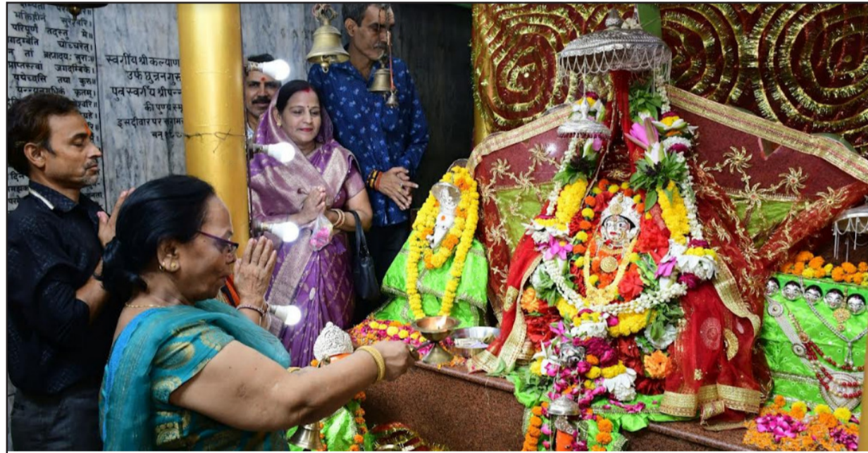
Devotees worshipping Maa Khema Mai located at Rani Mandi on the fifth day of Navratri.