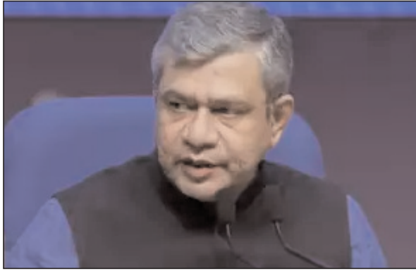
Rahul remark shows his prejudice against quotas, claims BJP

Union Cabinet's decision to extend Ayushman Bharat Pradhan Mantri Jan Arogya Yojana (AB-PMJAY) to all senior citizens aged 70 and above comes just before govt completes the first 100 days in office in its third term. "The scheme will be rolled out soon. All eligible senior citizens would be issued a new distinct card under AB-PMJAY. The senior citizens of the age 70 years and above belonging to families already covered under AB-PMJAY will get an additional top-up cover up to Rs 5 lakh per year for themselves (which they do not have to share with the other members of the family who are below the age of 70). All other senior citizens of the age 70 years and above will get a cover up to Rs 5 lakh per year on a family basis," I&B minister Ashwini Vaishnaw said. He added that eligible senior citizens already