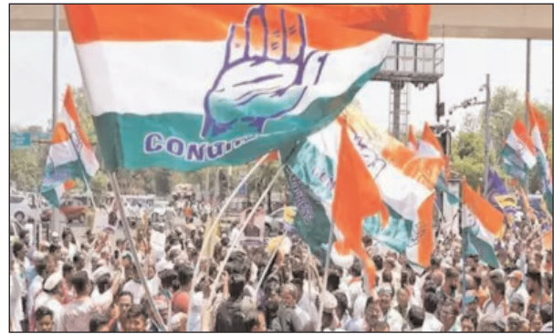
BJP slams Rahul Gandhi after Pannun backs his remarks on Sikhs