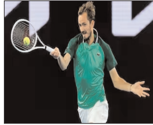
The third seed is now vying for his second

NEW DELHI: Daniil Medvedev staged a remarkable comeback from the brink to defeat Alexander Zverev 5-7, 3-6, 7-6(4), 7-6(5), 6-3 in a captivating semi-final match on Friday, securing his spot in the Australian Open title clash.