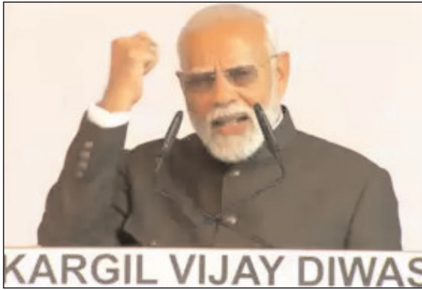
KARGIL VIJAY DIWAS MP the third BJP-led state to announce reservation in jobs for Agniveers

NEW DELHI: On the Kargil Vijay Diwas, as opposition cornered PM Modi-led NDA government over the Agniveer scheme, the Bharatiya Janata Party-ruled states moved to provide job reservations to the ex-servicemen. In back-to-back statements, the chief ministers of Uttarakhand, Madhya Pradesh, Uttar Pradesh, Chhattisgarh and Odisha announced the decision to provide job reservations to Agniveers in the state jobs while backing the scheme. Underscoring the importance of national security, Uttar Pradesh chief minister Yogi Adityanath criticised the opposition on Friday for allegedly misleading the public regarding the Agniveer scheme. He also stated that