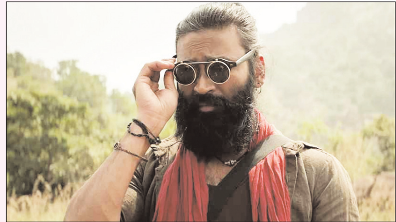
ECI national symbol Pankaj Tripathi retires

Delhi: Dhanush plays tribal, illiterate villager Annalesan (Eesa) in Captain Miller. Eesa is from a village ruled by the monarchs before the British took over. The people, who cannot enter the Shiva temple, think they must defend the shrine and the land their ancestors gave them. Eesa joins the military to get respect and independence after his family betrays his mother and he witnesses the kings' horrors. His brother Sengolan (Kannada star Shiva Rajkumar) tries to convince Eesa to join the liberation fight instead of serving the British in an intriguing discourse. Eesa wonderfully describes why he chose British slavery over his own humiliation. Eesa rebels after being told to slaughter and bury his people and joins a gang of dacoits who plunder the British and lead India's freedom fight. Eesa's rise from reluctant commoner to purposeful leader is intriguing. G V Prakash Kumar's background score is perfect, amplifying the plot and characters. The writing and cam-