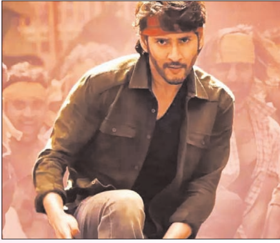
Sethupathi says his Merry Christmas role with Katrina startled people

Delhi, the makers of Guntur Kaaram finally showed the movie's trailer. The movie has Mahesh Babu, Sreeleela, and Meenakshi Chaudhary in the lead parts. It was directed by Trivikram Srinivas. Fans of the actor have been dying to see him on screen since 2022, so the video got a lot of views. Mahesh Babu is in great shape in the video as Ramana, who says a lot of lines and throws punches with ease. The movie would also be shown, and some of the other personalities would be shown. Ramya Krishnan is a woman who has left her oldest son, Ramana, who grows up in Guntur. Jagapathi Babu seems to play her father, and Sreeleela is the girl he falls in love with. A look at the video also shows that the movie might be sad when it comes to Ramana's family. As Vyra Venkat Ramana Reddy in Guntur Kaaram, Sreeleela plays Keerthi aka Ammu, and Meenakshi Chaudhary