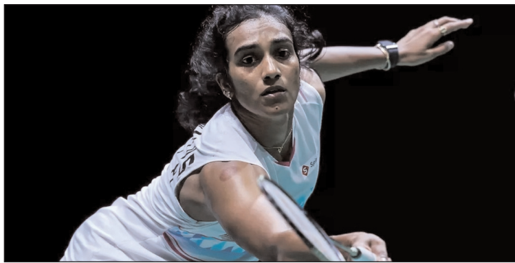
Axiata Arena to advance to the final. Sindhu defeated the higher-ranked Thai shuttler 13-21, 21-16, 21-12 in the 88-minute match. Her first tournament final since March last year. Sindhu has reached four BWF World Tour Super 500 finals

Delhi: Indian shuttler PV Sindhu defeated Thailand's Busanan Ongbamrunghan in the Malaysia Masters women's singles semi-final at Axiata Arena to advance to the final. Sindhu defeated the higher-ranked Thai shuttler 13-21, 21-16, 21-12 in the 88-minute match. Her first tournament final since March last year. Sindhu has reached four BWF World Tour Super 500 finals. In his first semi-final of the year, the two-time Olympic medalist lost the first game before showing her real courage. After a fierce battle, she took the lead from world no. 10 in the second game and led by two points at half-time. Keep calm and extend your lead to win 21-16. In