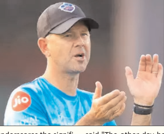
figure like Ponting

underscores the significance of the IPL in nurturing and showcasing emerging talent on the global stage.