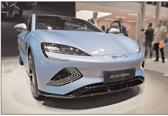
File ITR or risk scrutiny

Delhi: US President Joe Biden lambasted Beijing for "cheating" as he raised tariffs on Chinese products such as electric vehicles and semiconductors. Biden strongly opposed the sanctions as Biden sought to appear tough on trade ahead of a rematch with Republican Donald Trump in November's US presidential election. "We're not going to let China flood our market, making it impossible for American automakers to compete fairly," Biden declared in the White House Rose Garden. He said, "We're never going to allow China to unfairly control the market for these cars," before ordering duties. Trump's tariffs have been frequently criticized by Biden. He's been using similar tactics to win over blue-collar voters in swing Rust Belt states. The White House stated EV tariffs will treble to 100% this year and semiconductor duties will rise from 25% to 50% by next year.