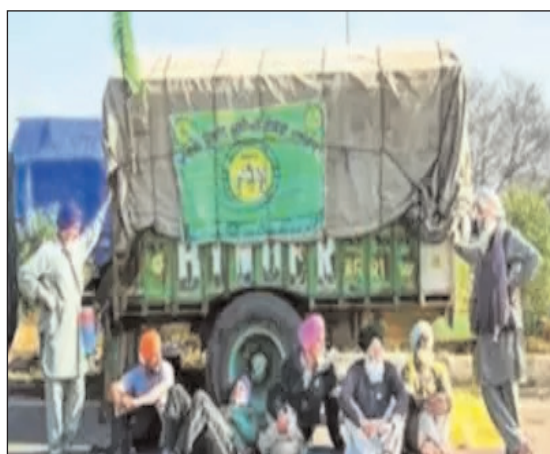
and convened an All Mazdoor India All Kisan Mahapanchayat at

BATHINDA/PATIALA: An uneasy calm prevailed at Shambhu and Khanauri protest sites on Punjab-Haryana border on Thursday, but more trouble loomed for the Centre as Samyukta Kisan Morcha (SKM), at forefront of 2020-21 farm agitation, joined the ongoing stir. It announced farmers would organise tractor marches on highways on Feb 26