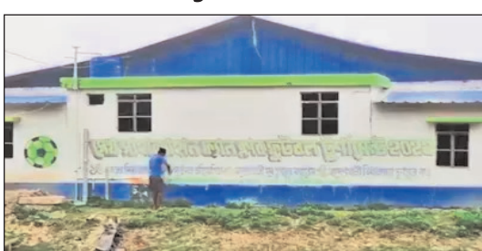
controlled by Sandeshkhali has been witnessing protests and retaliatory attacks since Feb 7 against associates of Shahjahan,

SANDESHKHALI/KOLKATA: Fresh prohibitory orders were clamped on Thursday in five gram panchayats of trouble-hit Sandeshkhali in Bengal's North 24 Parganas district after locals torched a bamboo structure set up to oversee fishing at a bheri (pond) allegedly