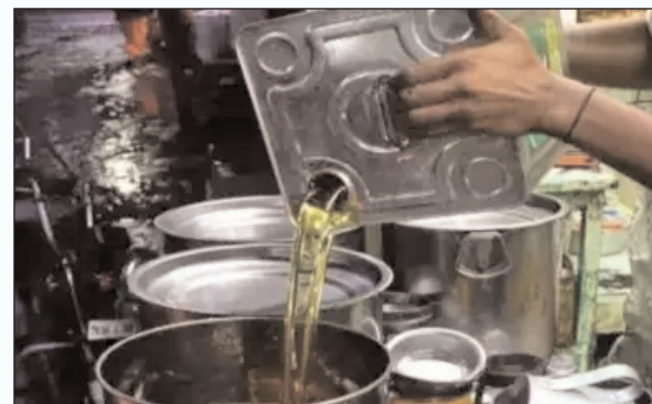
Gadkari orders probe into poor upkeep of Delhi-Mumbai, Amritsar-Jamnagar e-ways

Government data show that the prices of key edible oils have increased in the past two weeks after the Centre increased import duty on soyabean, sunflower and palm oil on September 13. While the average price of mustard oil has increased from Rs 141 per litre to Rs 152 in the past two weeks, palm oil was selling at Rs 122 per litre on Wednesday compared to Rs 100 on September 12. In the case of soyabean and sunflower oil, the increase in retail price during this period was around Rs 9-10 per litre. Recently, taking note of abnormal rise in