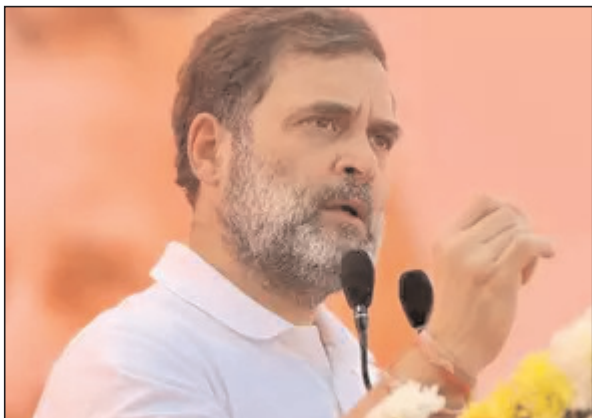
The mess in Kashmir is a legacy of Jawaharlal Nehru.

After he made this mistake, BJP's information technology cell chief Amit Malviya took a jab at Rahul Gandhi and said the Indian Overseas Congress chairman Sam Pitroda wanted people to believe that the