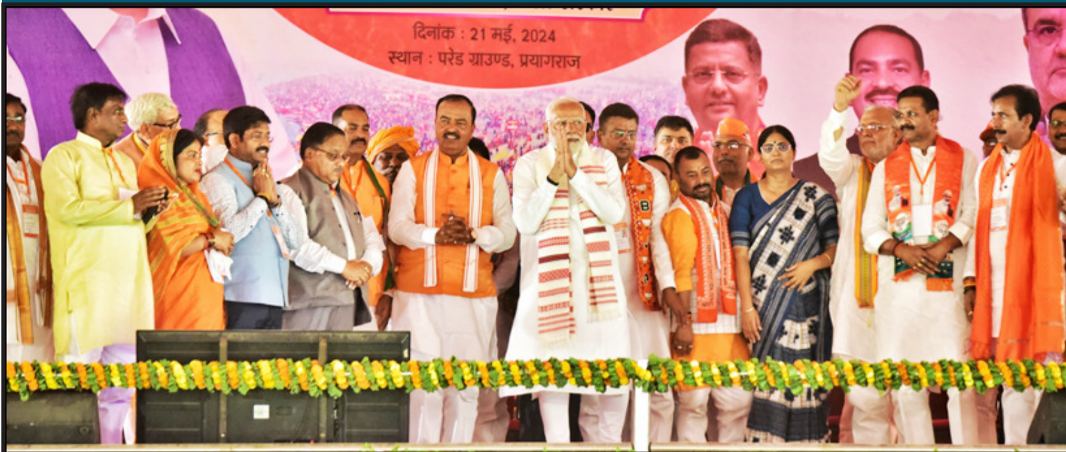
Prime Minister Narendra Modi addressed a huge public gathering in Prayagraj, emphasizing the cultural and spiritual significance of the region, highlighting the progress made under his government, and drawing sharp contrasts with previous administrations.