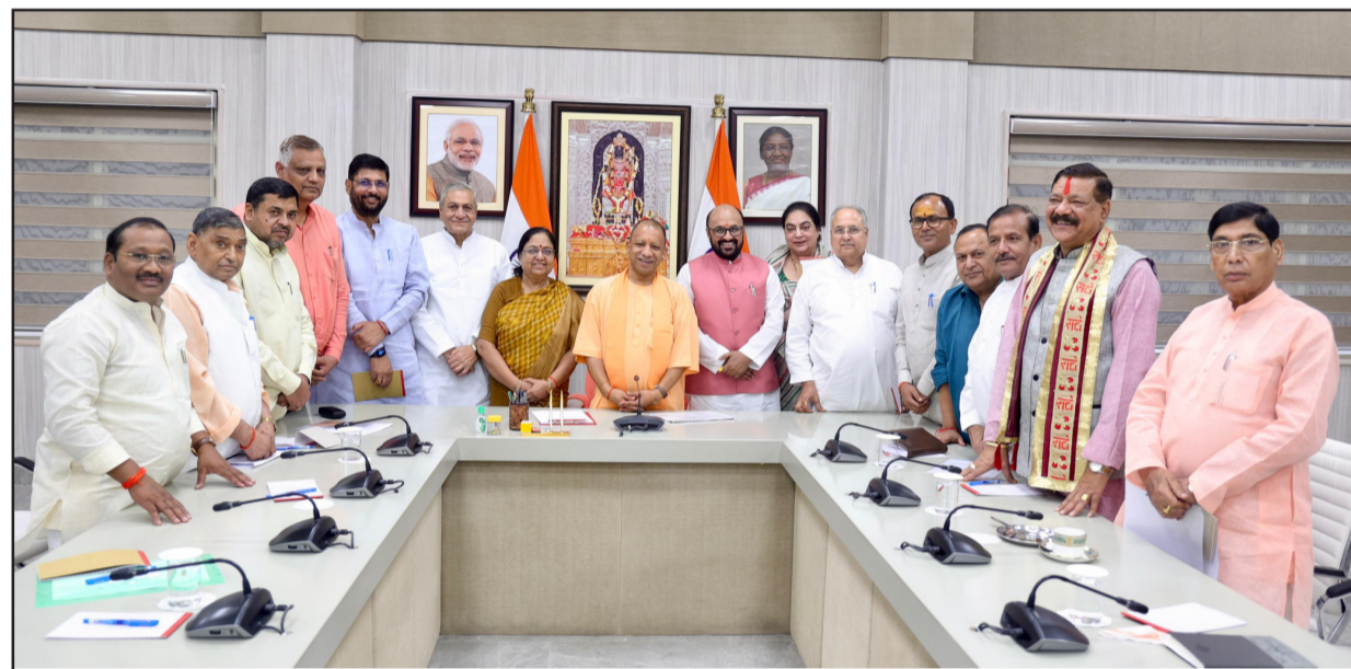
State Higher Education Minister Yogendra Upadhyay along with MLAs of Agra division on Friday met Chief Minister Yogi Adityanath at his official residence.

ity officials are not able to convince them not to take the belongings of the common people to their homes and Due to the slow pace of road widening work, they do not reprimand him in any way, the public is upset and the government is being criticized and further he also told the railway officials that you people should ask the officials of Prayagraj Development Authority to complete the work. Know the time limit and start the work of closing the bridge after 15 days, otherwise the public will have to face a lot of problems. BJP workers will not keep quiet on this. They will inform the situation to their top leaders.