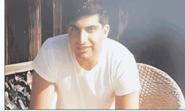
Visionary who led Tatas' revenue from $4bn to $100bn