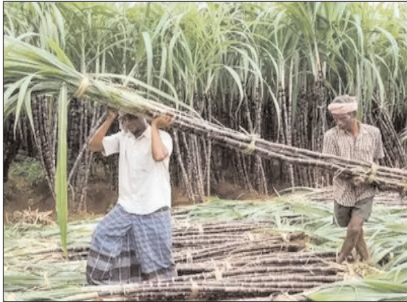
Govt eases FDI norms in space, allows 100% foreign investment for making sat components

NEW DELHI: Union Cabinet Wednesday approved a record hike of Rs 25 per quintal in Fair and Remunerative Price (FRP) for sugarcane, the price that mills have to pay, for the 2024-25 sugar season. I&B minister Anurag Thakur said the FRP for the next season has been fixed at Rs 340 per quintal compared to Rs 315 a quintal for the current season. The announcement of the revised price for sugarcane came much ahead of the usual schedule of June-August every year, at a time when farm unions are agitating on Delhi borders, demanding legal guarantee on MSP for 22 crops. Officials said it is the maximum ever hike in FRP in absolute terms. The decision is set to go down well with farmers from Western UP, coming as it does days after govt conferred Bharat Ratna on Chaudhary Charan Singh besides Karnataka and Maharashtra, three