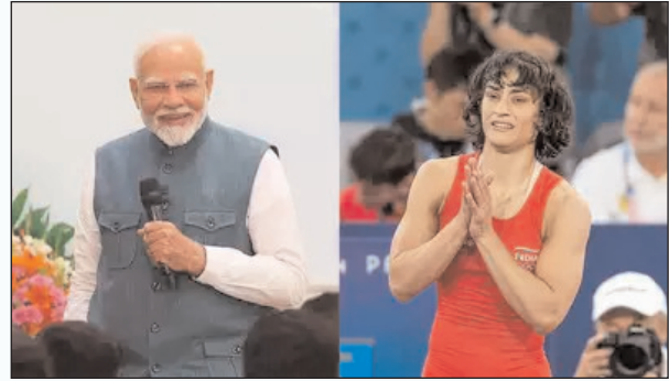
'Matter of great pride...': PM Narendra Modi lauds Vinesh Phogat

NEW DELHI: Prime Minister Narendra Modi met the Indian Olympic contingent at his residence upon their return from the Paris Olympic Games, where they secured six medals. In his interaction with the Olympians, PM Modi said that in sports, no one truly loses; everyone learns and praised the athletes for their dedication and achievements. Among the athletes present were India's youngest Olympic medalist Aman Sehrawat, shooters Manu Bhaker, Sarabjot Singh, Swapnil Kusale, and members of the Indian men's hockey team. PM Modi shook hands with the players and clicked pictures with them to commemorate the event. "First of all, remove the thought from your mind that you have returned to India after losing the Olympics. You have returned with the country's flag held high. You have also gained some valuable experience, and sports