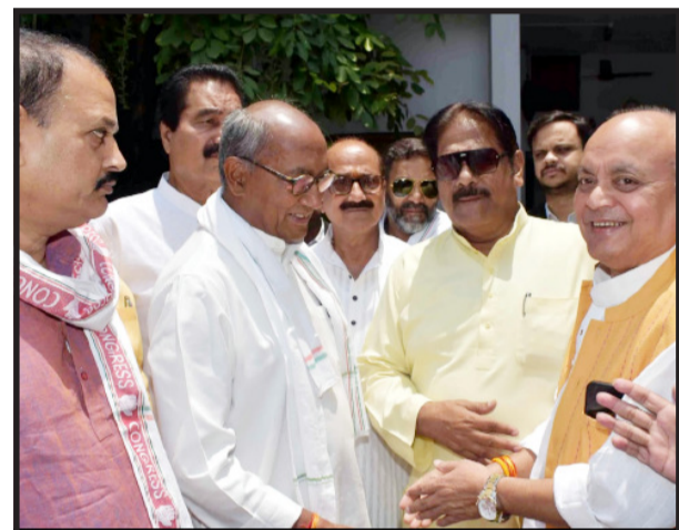
Congressmen welcoming former Chief Minister of Madhya Pradesh and Rajya Sabha MP Digvijay Singh

Modi, who are determined to protect the country, this ritual has been started to bring awareness about voting among the people and is getting huge support from the general public and Laxman Bazar Vyapar Mandal. And there is a lot of enthusiasm among the people about voting and Modi government again. The successful Prime Minister of the country has brought the name of the nation to the top at the world level. He has made every impossible task possible, be it Ram Mandir, Article 370, every impossible thing. Modi ji has completed the task, even if it is triple talaq, this ritual is to fulfill Modi ji's resolve of turning 400. God will definitely fulfill his wish. This ritual will continue till the end of the elections. The common people will ensure their participation.